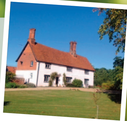
Bed & Breakfast

A 'national community', our members span the length and breadth of the country yet we provide a close-knit network of support through Farm Stay UK Groups. Members value the friendship and support of fellow farming and countryside families – often exchanging experiences, ideas and best practice. It's what life in the countryside is all about. Members are also offered ongoing support, industry advice and training as part of their membership.