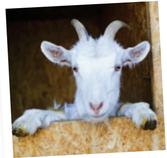
Feed the Animals